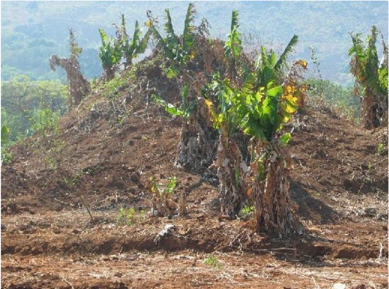
Fig. 2. Farmers' practice of planting crops around termitaria. This farmer in Zomba district of southern Malawi has planted banana and pigeon pea on an Odontotermes mound.