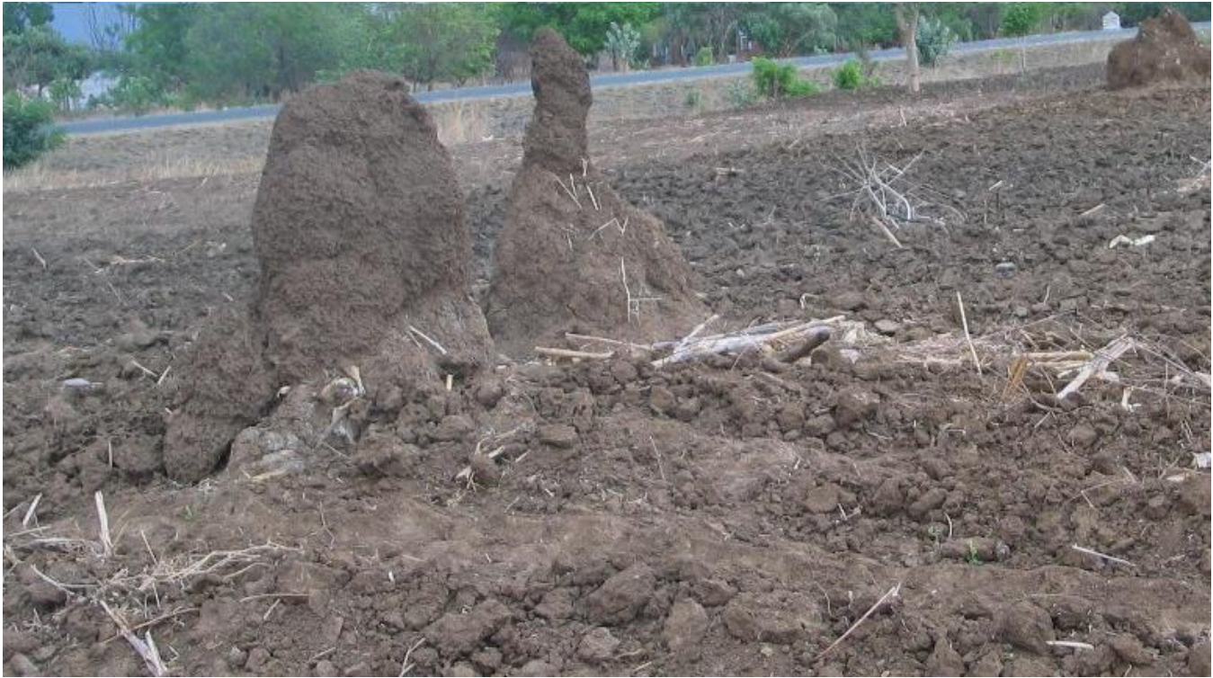
Fig. 3. Farmers' usually leave termitaria intact when cultivating crop fields. This figure shows live Macrotermes mounds left in a field ready for planting maize in Balaka district of southern Malawi.

Sileshi et al. 2005). In Uganda, termite attack was lower in maize–soybean ( Glycine max ) than in maize–groundnut or maize–bean intercrops (Sekamatte et al. 2003). Similarly, in Zambia, some legume trees in agroforestry reduced termite damage to maize more than others (Sileshi et al. 2005). These differences could be attributed to variations in leaf litter, which serves as an alternative source of food for termites and the thick canopy in the intercrops that encouraged predation (Sekamatte et al. 2003, Sileshi et al. 2005).