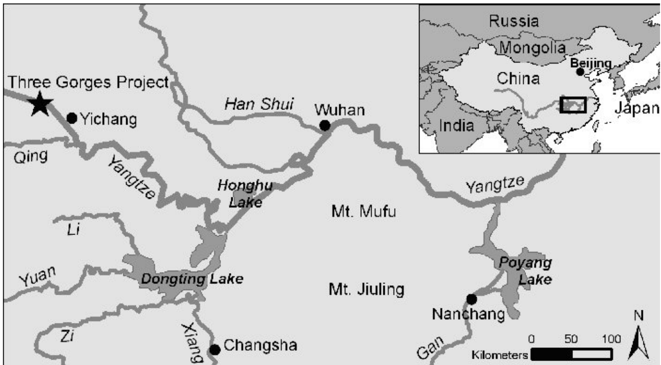
Fig. 1. China and the Yangtze River basin, including Poyang Lake and Dongting Lake.

areas in China, known as the Yangtze River Economic Belt. The Yangtze is also the major inland navigation waterway with a navigation channel totaling 57,000 km (of which 2837 km is mainstream), 52.5% of the nation's total. The shipping capacity is equivalent to four to six railways, each of this same length (Changjiang Water Resources Commission (CWRC) 2009). The Yangtze is a major resource for irrigation, agriculture, and hydroelectric power (with a technically exploitable potential of 25,6270 MW and an estimated annual power output of more than 100 TWh, equivalent to 48% and 49%, respectively, of the nation's totals). It currently holds 17 hydroelectric dams, including the well-known Three Gorges Dam. The Yangtze agricultural area delivers close to half the country's total crop harvest and contributes about a third of the national grain and GDP total. The river basin is recognized internationally as an important ecosystem that is rich in biodiversity (Yin et al. 2006), and currently, six wetlands are listed as sites under the Ramsar Convention on Wetlands of International