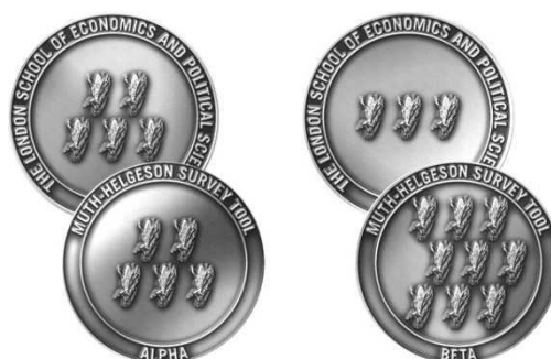
The Choices Offered in Round One of the Coin Game

After the subject chooses between Alpha and Beta in the first round, he is provided in a second round with a choice of two new coins. The choice of coins depends on the coin chosen in the first round, according to the decision tree in Figure A.2. It is possible to go through three rounds (triple-bounded), as illustrated by the shaded pathway in the figure.