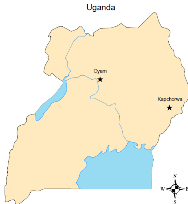
Fig. 1. Study areas: Oyam ( 02^{\circ}14'04''\text{N} and 32^{\circ}23'06''\text{E} ) and Kapchorwa ( 01^{\circ}24'00''\text{N} and 34^{\circ}27'00''\text{E} ).

Farming methods in these two areas are traditional, not encompassing much technological advancement. Only 1% of the households we sampled own a borehole, for example, and mechanized ploughs and active irrigation are seldom used.