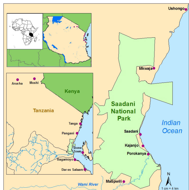
Fig. 1. Study sites.